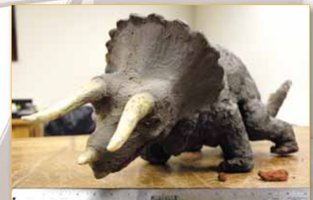
The triceratops from the Samuel A. Peoples Collection.

The model was first used in an uncompleted 1931 film titled Creation. The stop action footage for this movie was then used in King Kong. However, the triceratops was edited from the finished version of the 1933 movie, although the original Creation test footage can be found on the R1 King Kong DVD released by Time-Warner in 2005. The exhibit discusses the technique of stop-motion photography and that the triceratops is Wyoming's state dinosaur.